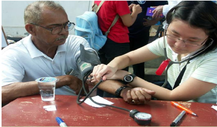
Figure1: Primary health problems of adult asylum seeker or refugee