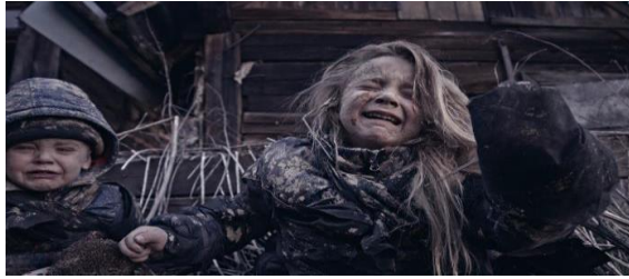
Figure1: Primary health problems of child and adolescent asylum seeker or refugee